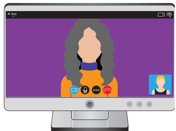
Video call with Skype

During the call, you'll see the face of the person you're calling filling up most of the screen. You'll also see your face in a small box in the bottom. This is so you know what you look like to the other person.